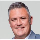
Roland Magerl AfD