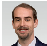
Markus Walbrunn AfD