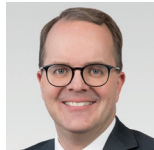
Markus Rinderspacher SPD