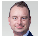
Benjamin Nolte AfD