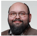
Markus Striedl AfD