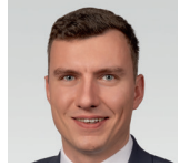
Oskar Lipp AfD