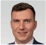
Oskar Lipp AfD